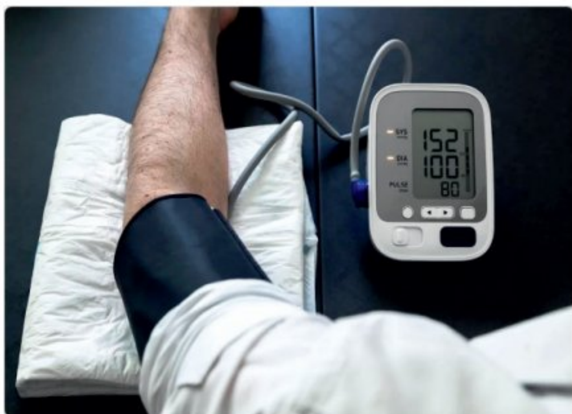
Hypertension(HTN), Cardiovascular Disorders