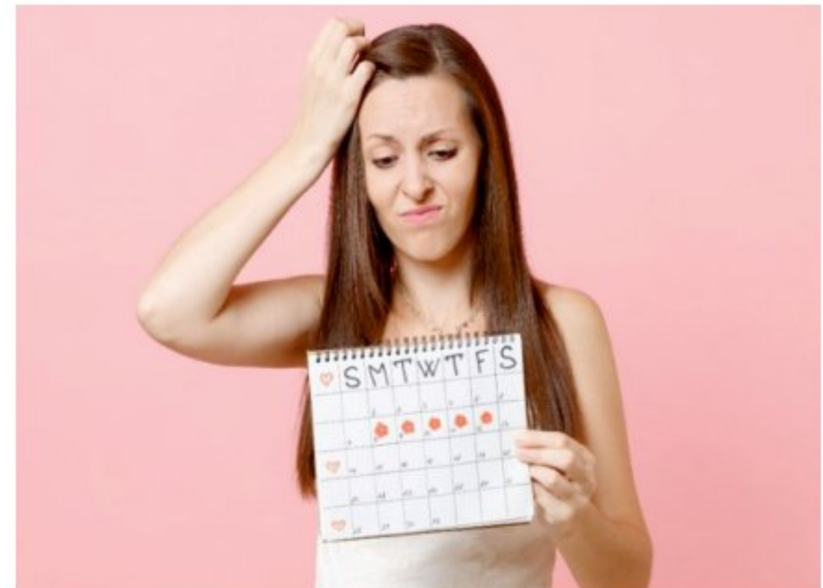
Lifestyle Disorders (Obesity, Thyroid Issues, PCOS)