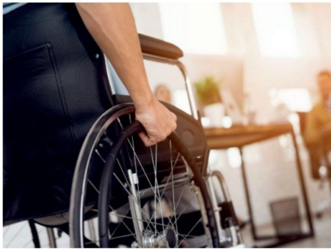
Paralysis Rehabilitation Center