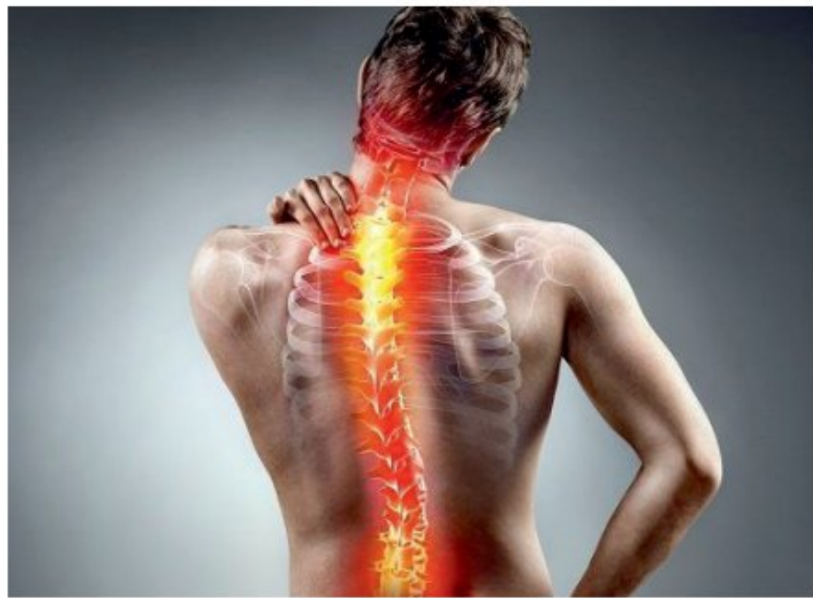
Arthritis & Spine Care