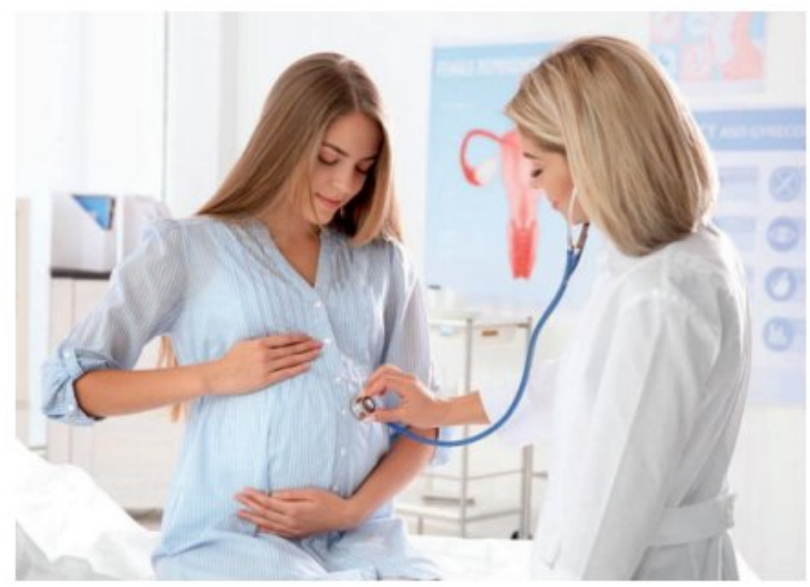
Gynecological Care, Infertility Management