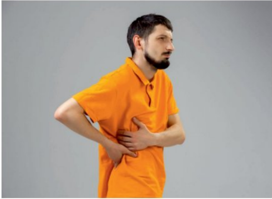
Renal Calculus & CKD