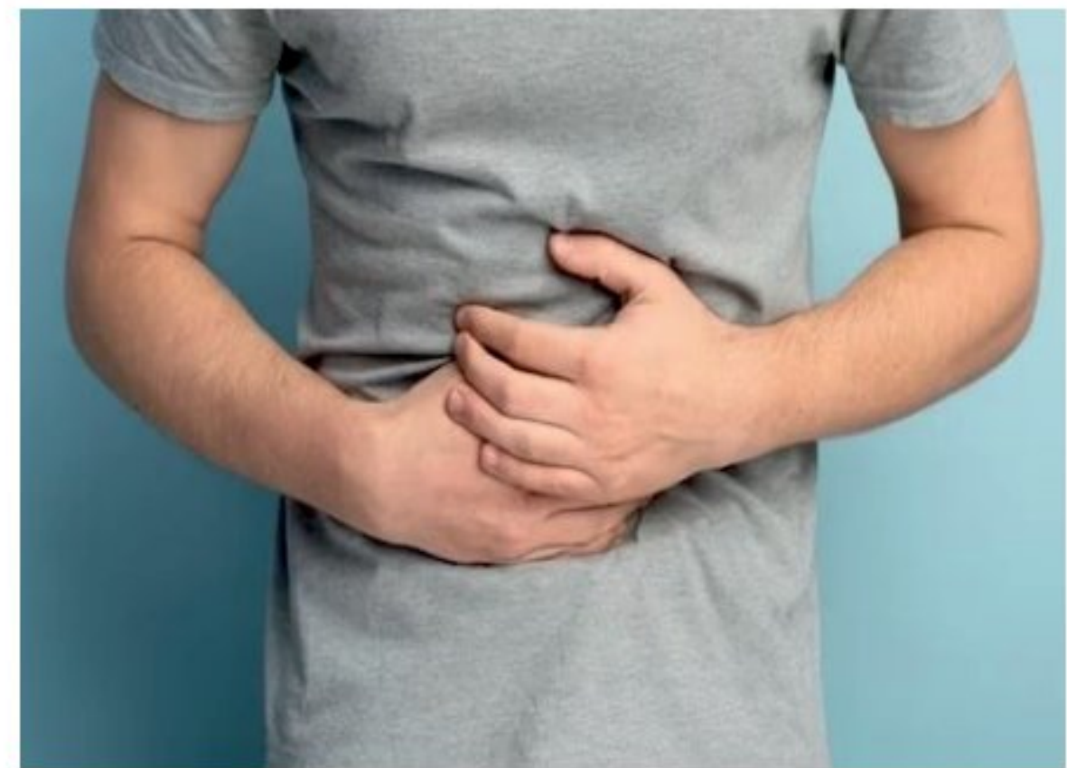
Liver Disorder & IBS